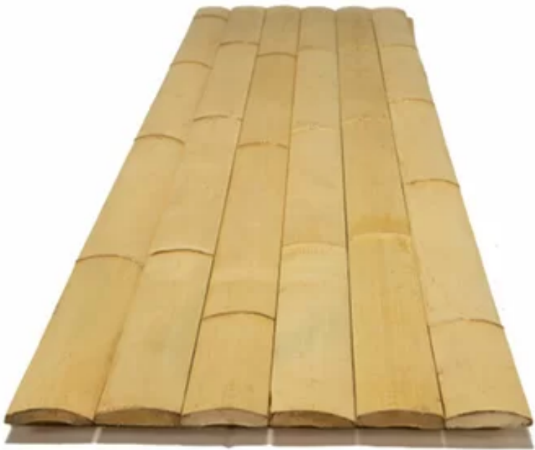
Natural Bamboo Slats Made from Milled Moso Bamboo

All our giant bamboo poles are dried to a moisture content of between 15–18% to avoid cracking in drier climates and boron treated against insect infestation and mold forming.