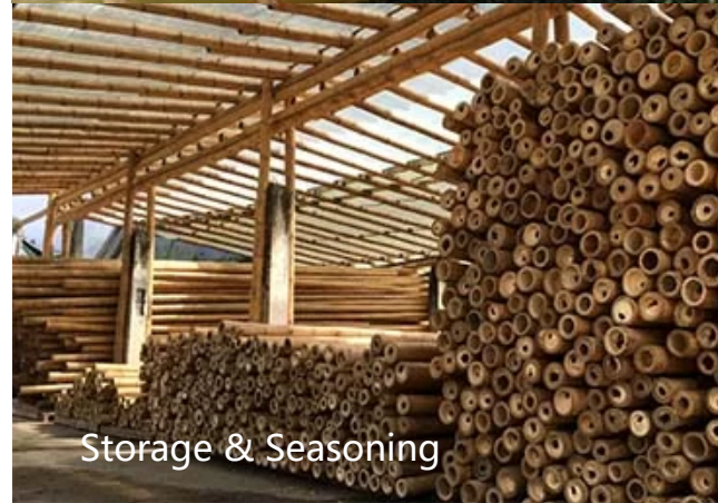
Storage & Seasoning