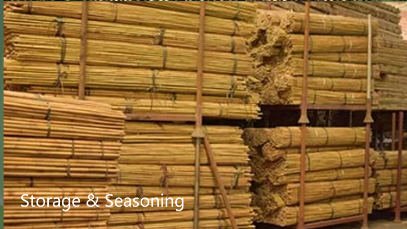
Storage & Seasoning