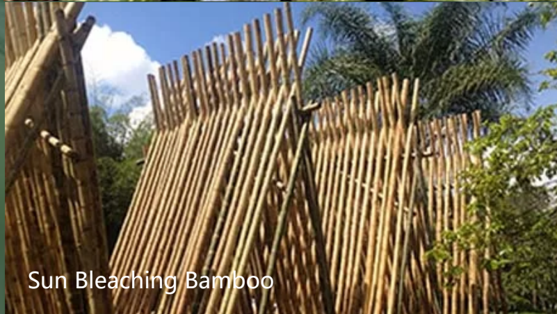
Sun Bleaching Bamboo