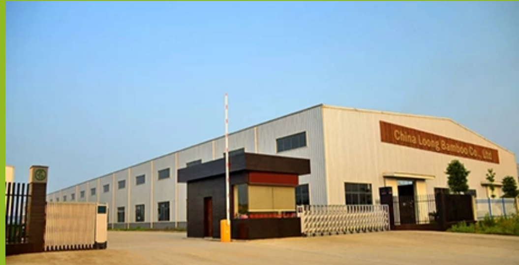
China Loong Bamboo Co., Ltd

Customer satisfaction is the cornerstone of their business philosophy. China Loong Bamboo Co., Ltd. offers excellent pre-sales and after-sales services, reflecting their dedication to client needs. Their products are shipped globally, benefiting from extensive international market experience. The company welcomes partnerships with distributors, partners, and end-users, aiming to explore collaborative opportunities and fulfill client requirements.